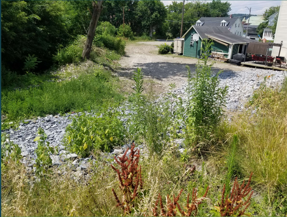
115 Main Street