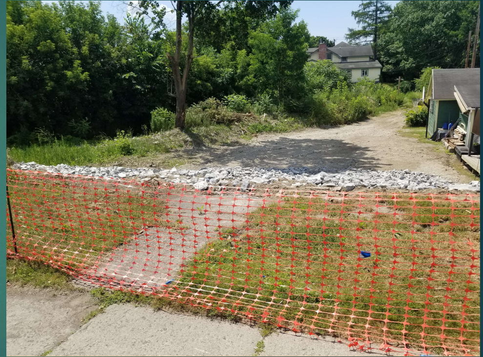
107 Main Street