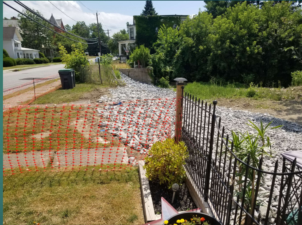
From south edge of 115 Main Street