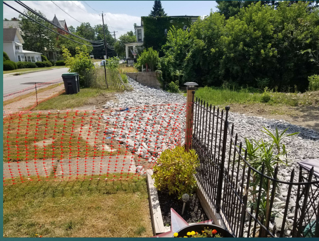
From south edge of 115 Main Street